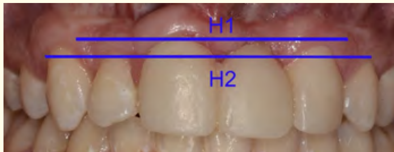
Figure 3: Gingival heights measured after periodontal surgery showing improved symmetry between the centrals through canines.