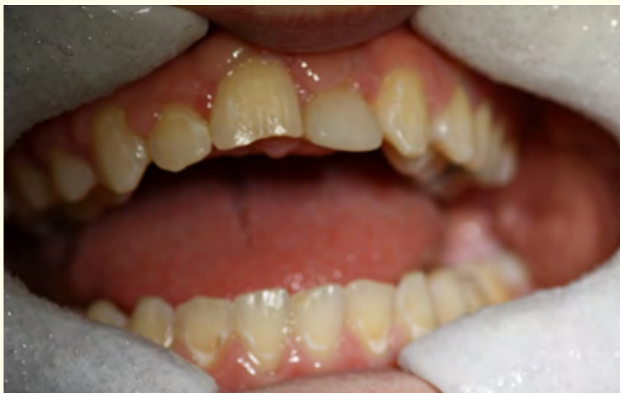
Figure 1: Retracted anterior view showing gingival discrepancies.

stabilize his teeth and soon afterwards his orthodontic treatment started. His pediatric dentist placed composite on both his remaining central incisor #8 and his lateral incisor #10 to mimic central incisor widths. Having determined the bone was too thin and damaged to save the space for a future implant, the decision was made to close the central space and use porcelain crowns to rebuild the fractured central incisor, reshape the lateral incisor into a central incisor, and the canine into a lateral incisor leaving the patient's left premolar to mimic the left canine.