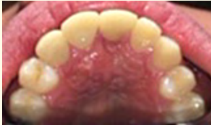
Figure 5: Occlusal view of final crown placement showing gingival contours of the lingual surfaces as well as the arch form generated with the new crowns in place.