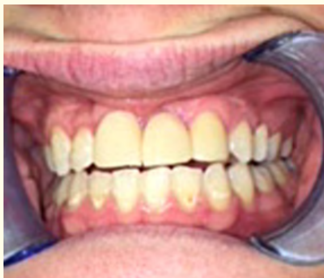
Figure 3: Gingival heights measured after periodontal surgery showing improved symmetry between the centrals through canines.