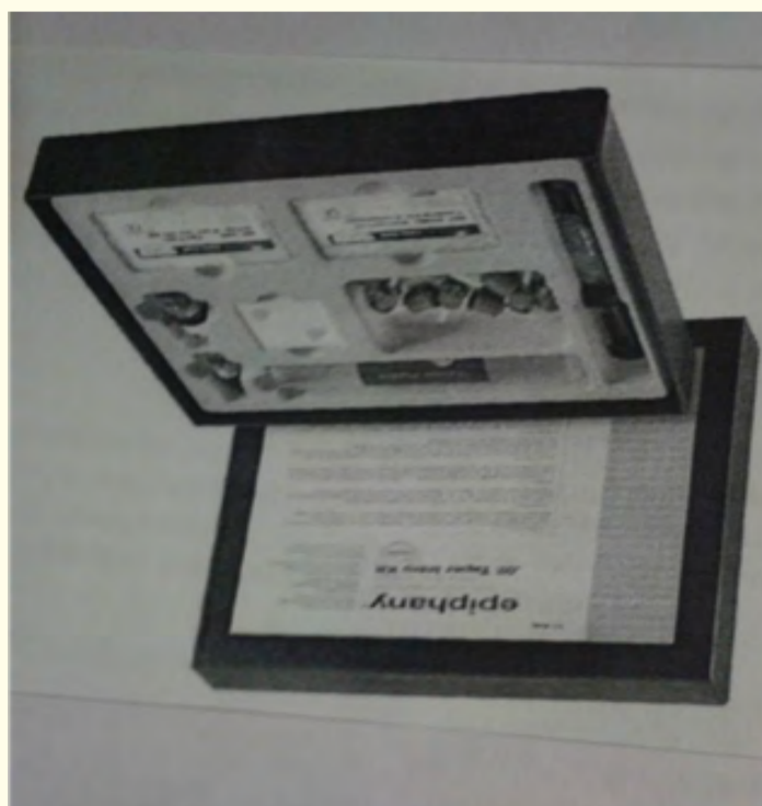
Figure 1: Resilon Epiphany.

Lateral Cold Condensation: This technique has been the gold standard to which other techniques have been compared. Lateral cold condensation has the advantage of excellent length control and can be accomplished with any of the acceptable sealers. However, this technique may not fill canal irregularities as well as the, warm vertical compaction technique.