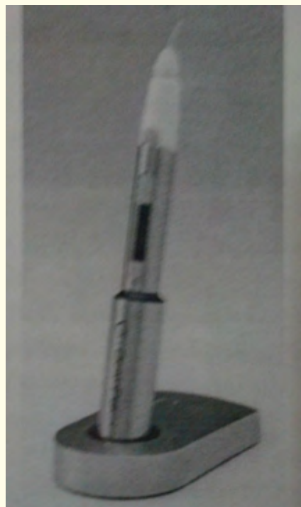
Figure 6: The Down Pak device.

Vibration has been shown to increase gutta-percha fill density. Studies have shown that Down Pak's combination of heat and vibration resulted in a denser more compact filling of the root canal space. It is claimed that the system works with all warm condensation techniques and may even benefit cold lateral techniques when using the only vibration feature.