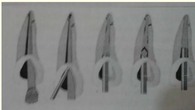
Figure 3: Warm vertical condensation.

It has been found that a higher percentage of the canal area is filled with gutta-percha in oval canals using the warm vertical condensation technique. Advantage of warm vertical compaction technique include movement of the plasticized gutta-percha and filling of canal irregularities and accessory canals. It is difficult to obturate curved canals with this technique. Disadvantage include risk of vertical root fracture and extrusion of material in to the periradicular tissues.