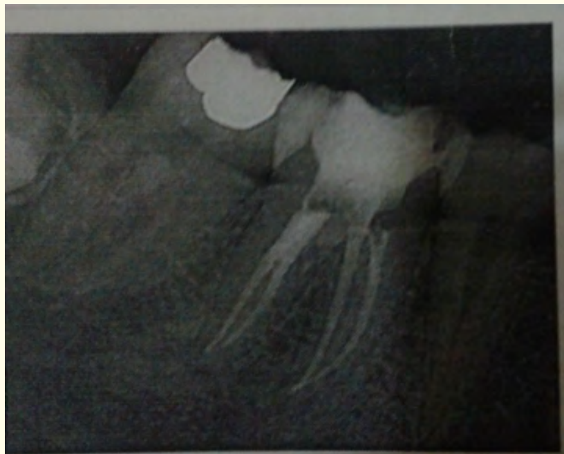
Figure 5: Root canal obturated radiograph.