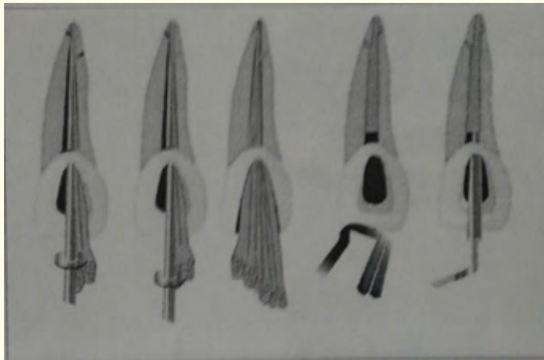
Figure 2: Lateral cold condensation.

Use of vibration, heat and ultrasonics: An alternative to cold lateral compaction with finger spreaders is ultrasonics and more recently, a combination of vibration and heat using the DownPak obturation device. It has been found that an ultrasonic condensation technique produced adequate obturation and clinical success rate. Lateral condensation can be employed by alternating heat after the placement of each accessory gutta-percha cone. Heat can soften the cone for better condensation and homogeneity of gutta-percha.